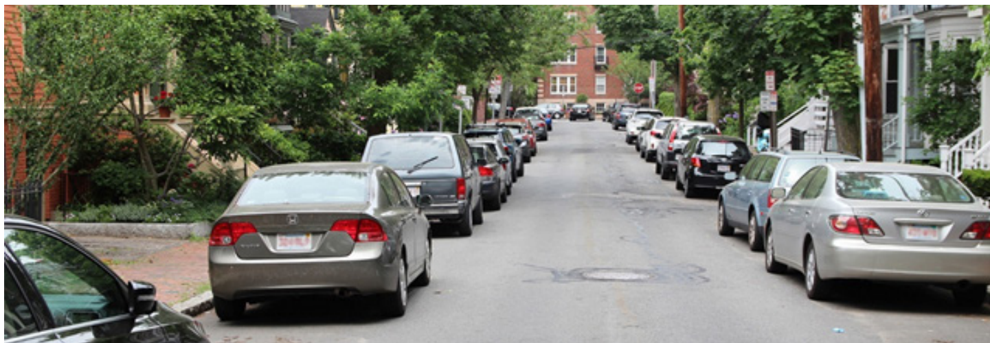
Figure 2: Road space consumed by on-street parking in Freiburg, Germany; more space is given to parked cars than to either pedestrians or travelling vehicles