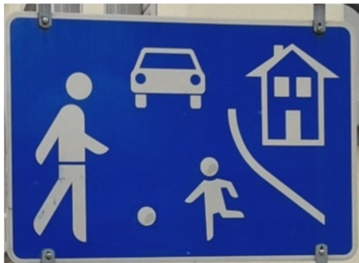
Figure 5: A German residential area road sign ( Spielstraße ), although these are used more widely than just in residential areas

The shared character of the road is the most relevant element, but typically the physical configuration of the area also reinforces such coexistence. Vehicle users must adapt their driving/walking style while going in/out, moving and use such areas. Traffic calming interventions and opposing one-way streets/modal filters are used to prevent through traffic. The success of the Dutch woonerf 25 concept ( woon = residential, erf = yard) is due to a combination of a strict law and road design elements. In France, Switzerland, Austria and Belgium, these are named encounter zones ( zone de rencontre , Begegnungszone ). These areas can be referred as pedestrian priority zones . The COVID-19 pandemic has also promoted this approach, for both temporary and permanent schemes, both in Europe and elsewhere.