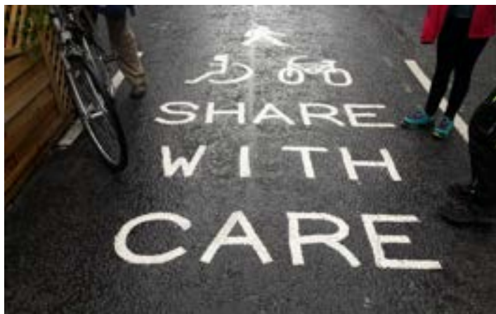
Figure 6: A newly implemented shared space in Bristol, UK

A 30 km/h limit is usual in such zones, and similarly, but with less emphasis on road use and design, 30 km/h (20 mph) zones can also support these aims, particularly where the legislation does not allow other UVAR types. Of course, traffic calming elements remain fundamental and should be present in addition to the prescribed speed limit signs for drivers.