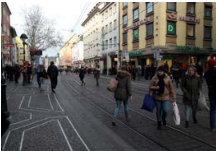
Figure 3: Examples of pedestrian zones: Centre of Ravensburg (T), Freiburg shopping centre (B), Germany

Sometimes – but only if signposted as such – pedestrian areas might admit a very limited number of vehicle categories such as people with reduced mobility (with proof, such as a blue badge), residents who need to reach their garage, delivery vehicles (usually in a short, off-peak time window) or public transport. Parking is never allowed and permitted vehicles must travel at walking speed. Emergency vehicles may of course access pedestrian areas at any time without the need for a permit.