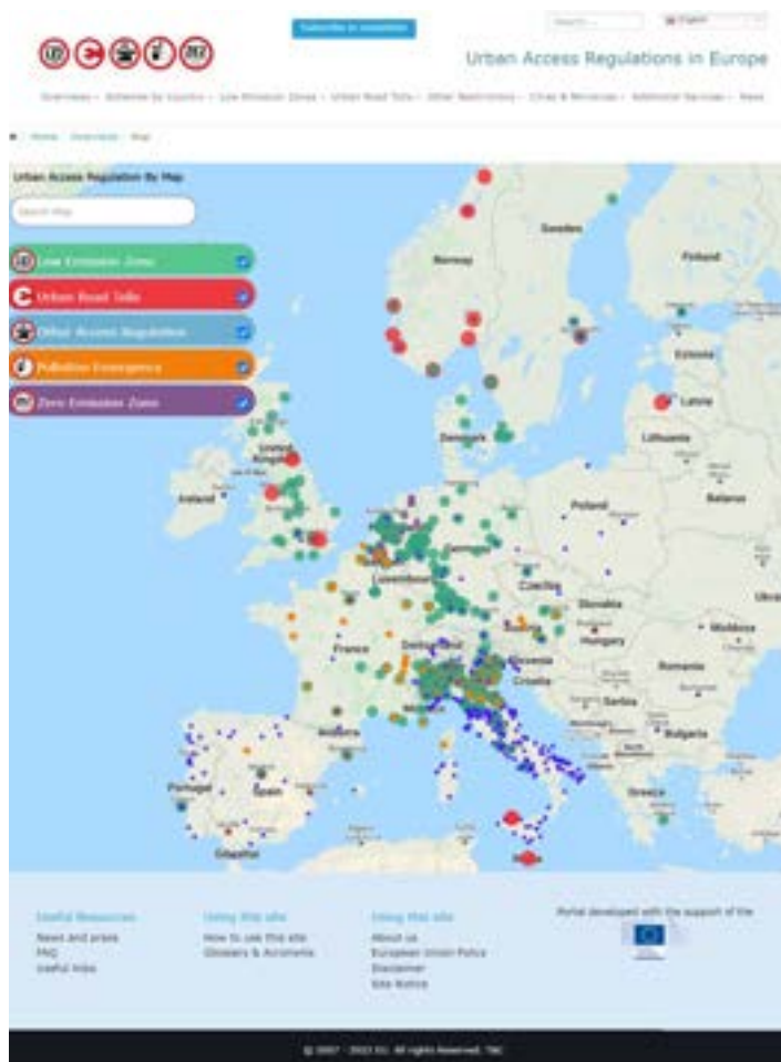
Figure 1: UVARs across Europe as shown on www.urbanaccessregulations.eu

Over 700 UVARs are currently in place in roughly 500 cities across Europe. These are shown in Figure 1, with more details available at www.urbanaccessregulations.eu 1 , where further details on these UVARs can also be found.